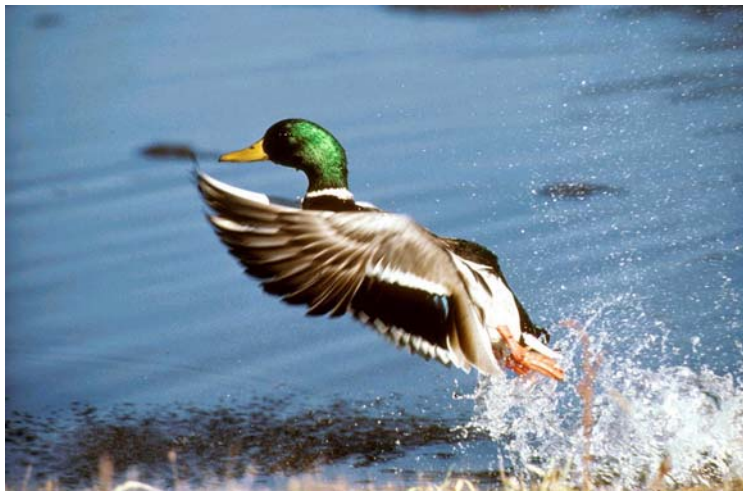
Fairlee Marsh offers excellent opportunities to watch and hunt waterfowl.

Fish Fairlee Marsh provides fishing during the open water and ice seasons for bass, yellow perch, chain pickerel, northern pike, bluegill and brown bullhead.